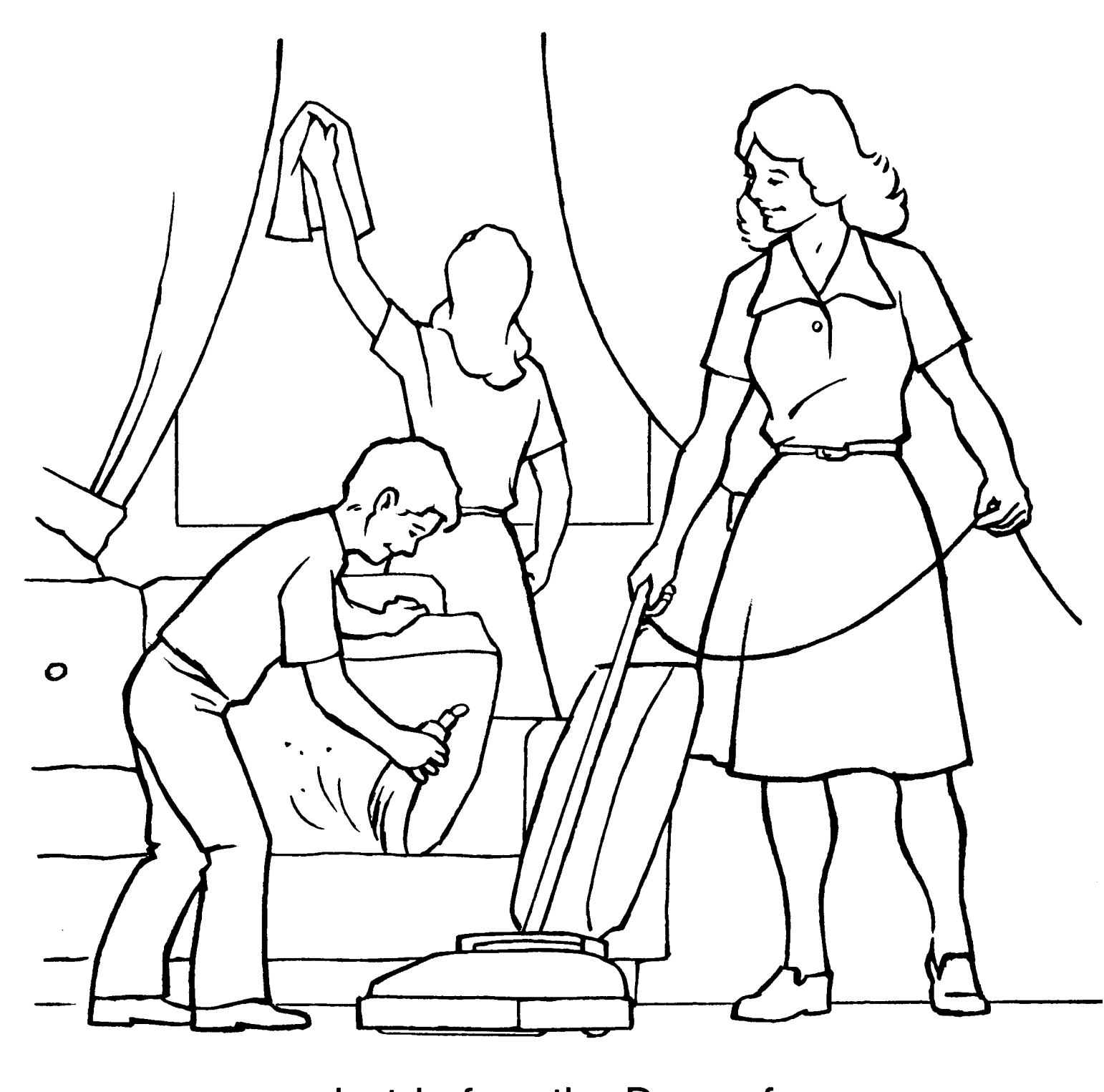
Just before the Days of Unleavened Bread, we must put all the leavening out of our homes.

Parents: Ask your child what leavening has to do with bread. Then explain the relationship between leavening and sin, and why it is so important not to sin.