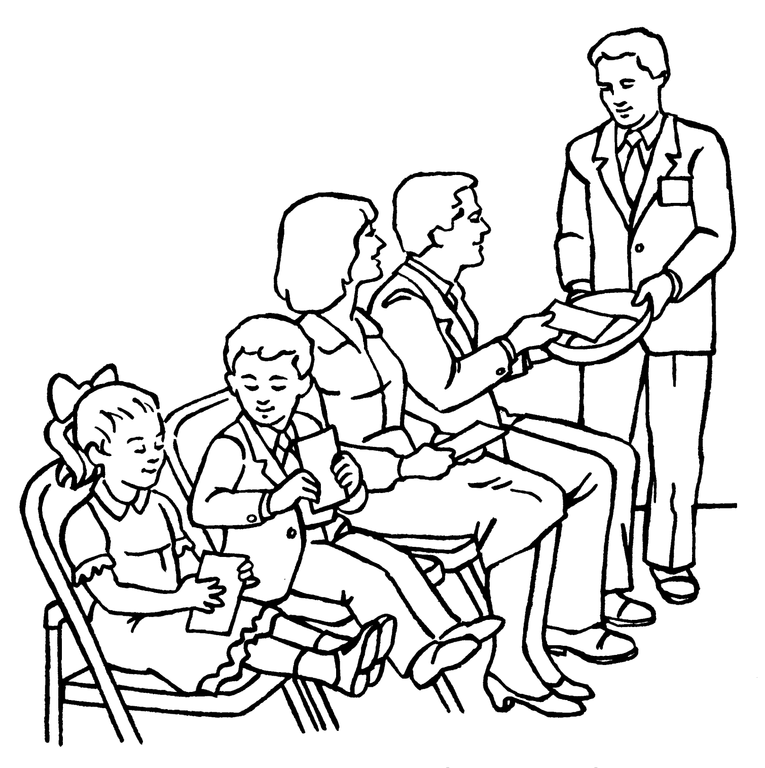
Pentecost pictures God's people as the "firstfruits" of those He is calling into His Family.

Parents: Explain to your child that he or she will help teach God's way of life — the way of "give" — in the World Tomorrow.