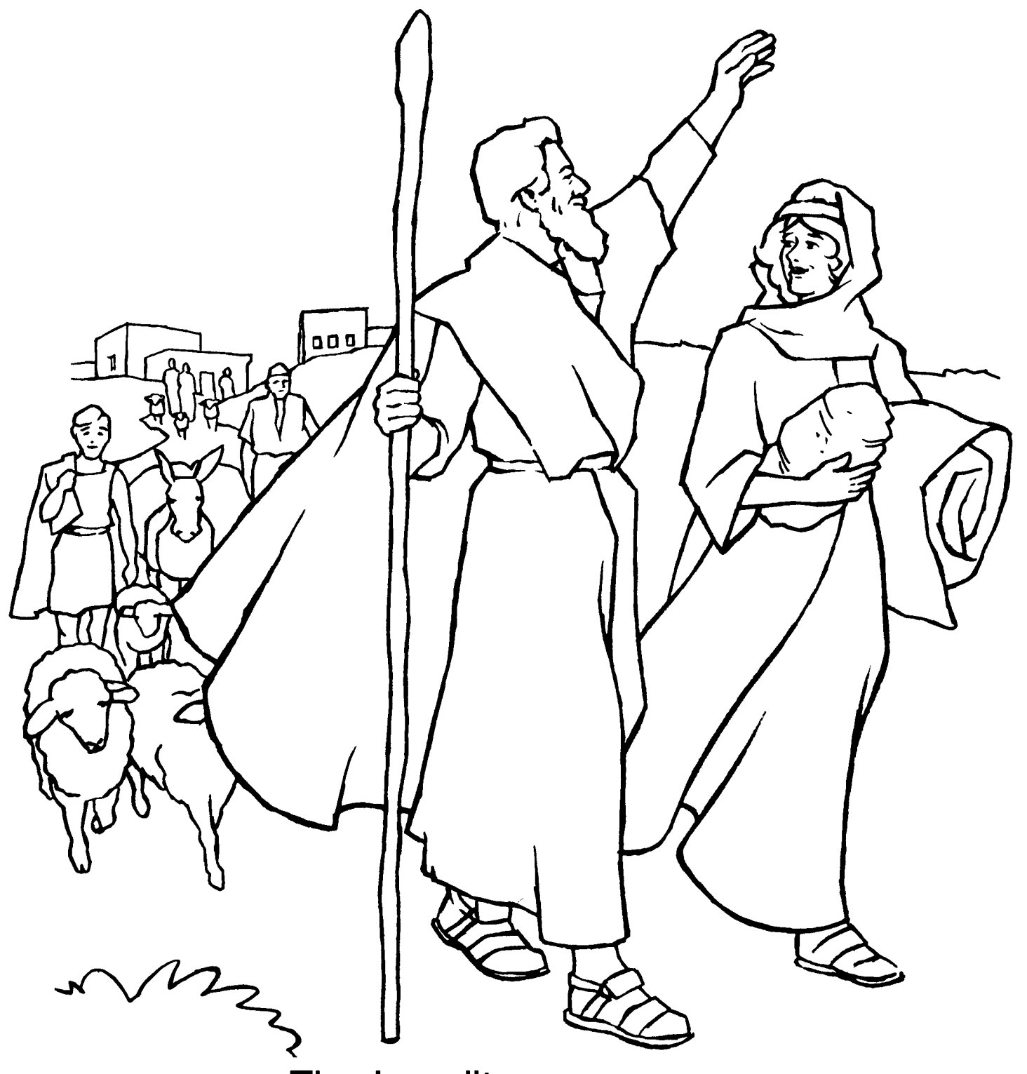
The Israelites were very happy that God delivered them from slavery in Egypt!

Parents: Ask your child this question: What did the Israelites celebrate on the night they left Egypt, that God's people celebrate today?